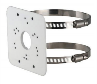
CP-UA-B2P Pole Mount